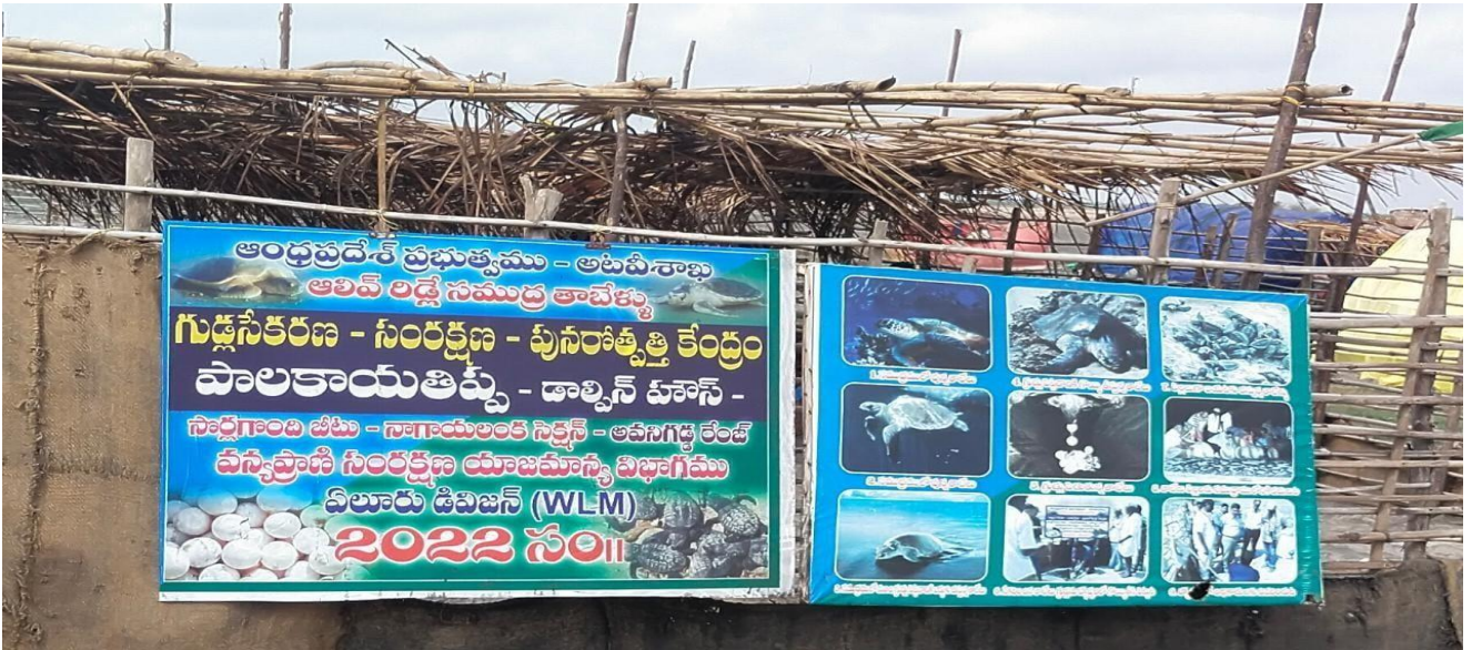
Hatchery center of Olive Ridle TORTTELS