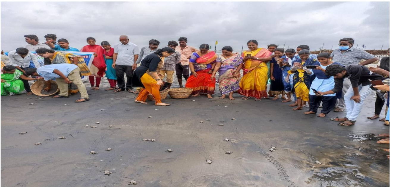
carefully releasing baby turtles into the sea.